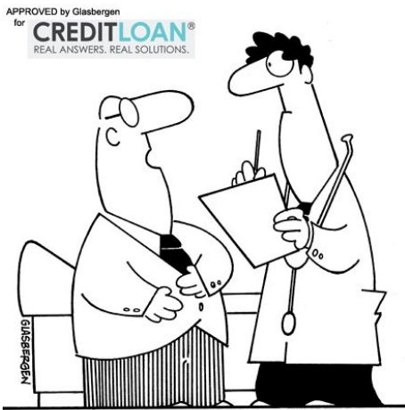
"Lately I've been feeling ethical. Can you prescribe something for that?"