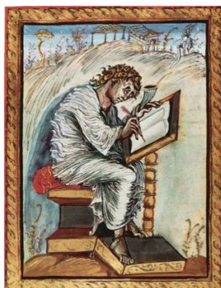
St. Matthew the Evangelist Medieval Europe c. 825-850 CE.