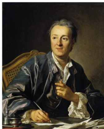
Denis Diderot by Carle van Loo Enlightenment France 1767.