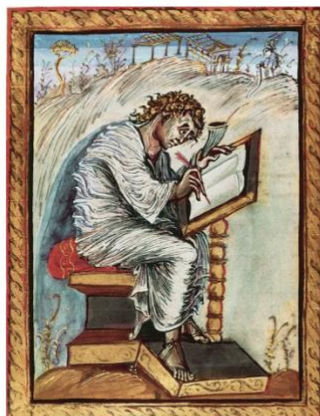
St. Matthew the Evangelist Medieval Europe c. 825-850 CE.