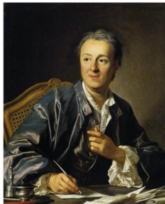
Denis Diderot by Carle van Loo Enlightenment France 1767.